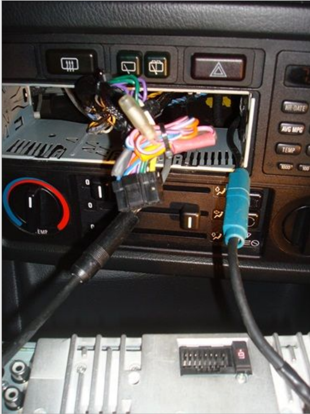
Step 3 Pop out the switches from behind