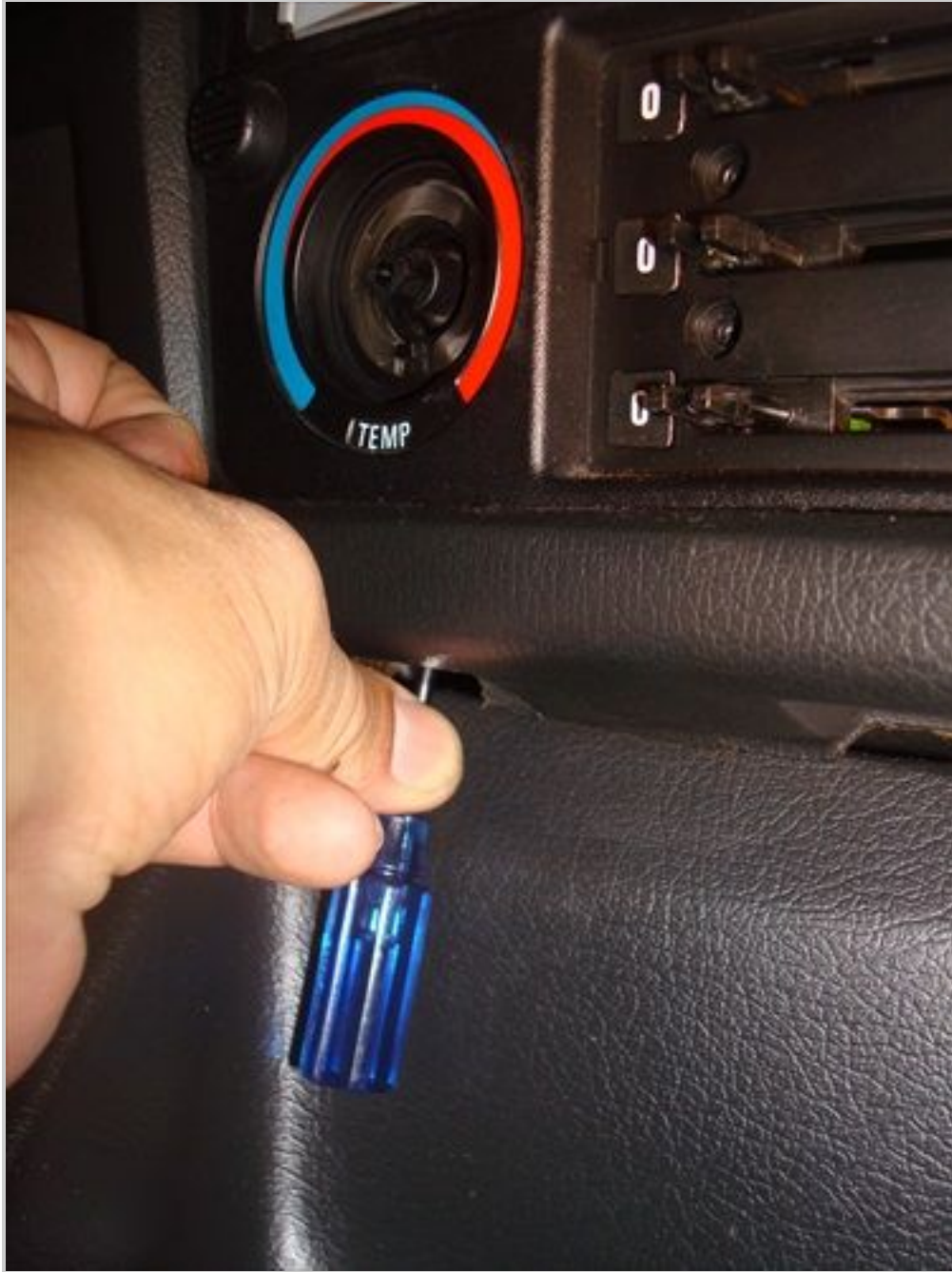
another angle of the bottom left