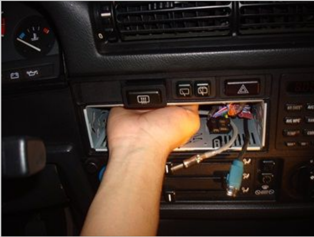
Switches popped out