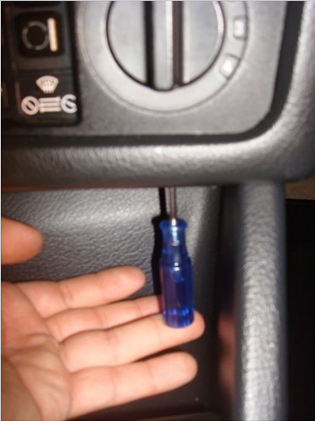
another angle of the bottom right