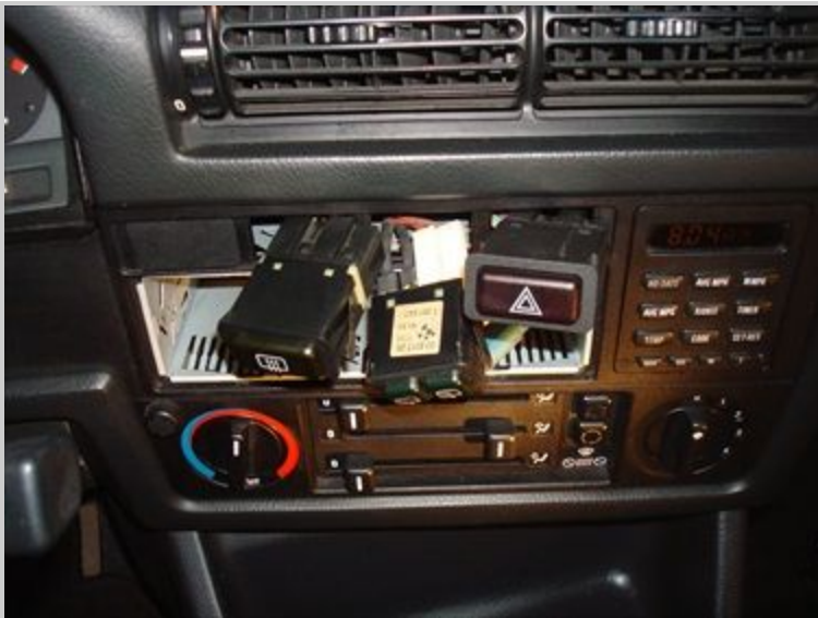
Unplug them because the screws needed to remove the panel are behind them.