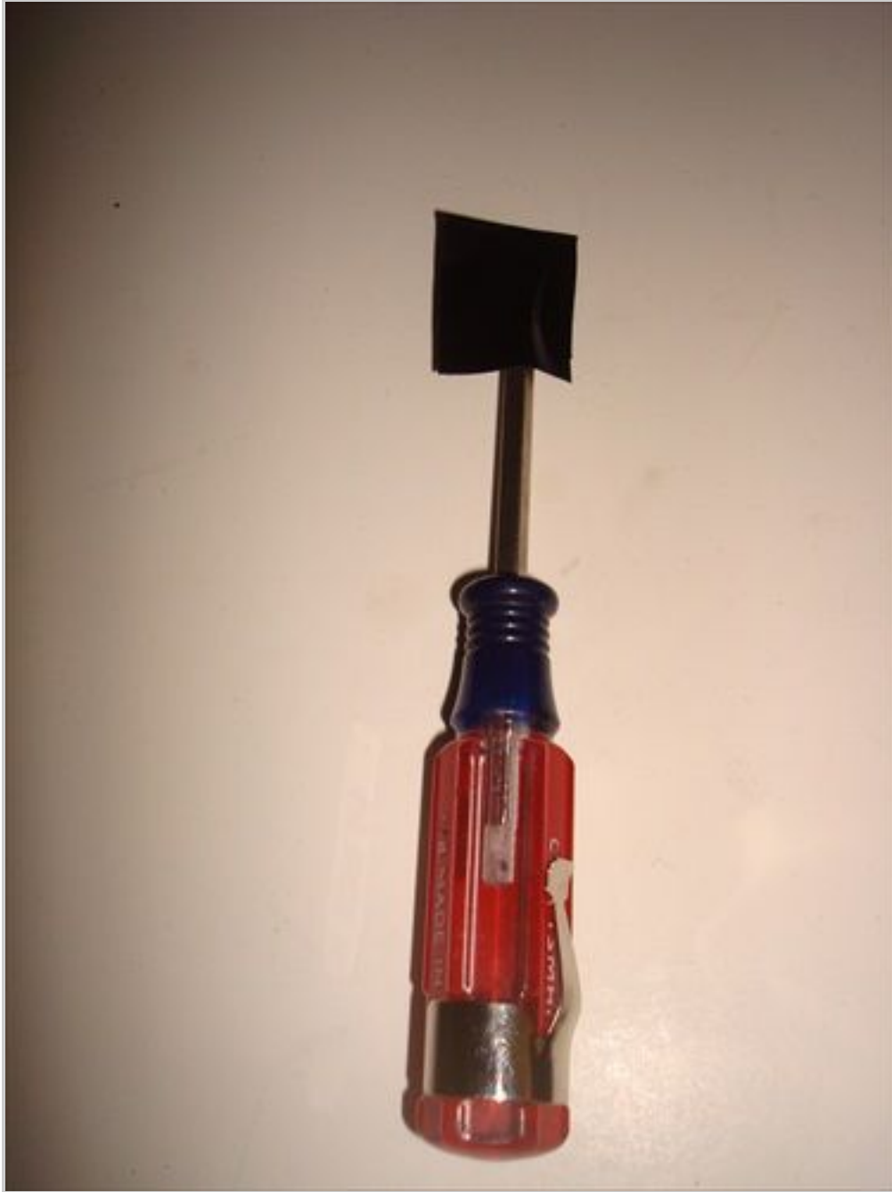
prying the panel outward